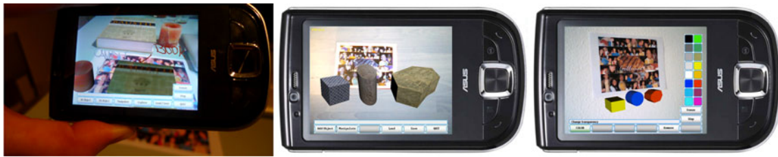
Fig. 3 Example showing created augmented 3D content and interface using the system configured for small working environments. Left Augmented scene with augmented duplicates of real objects (book and candle). Middle Augmented scene showing different object

shapes with different applied textures. Right Augmented scene showing different objects with different colors and interface for selecting colors