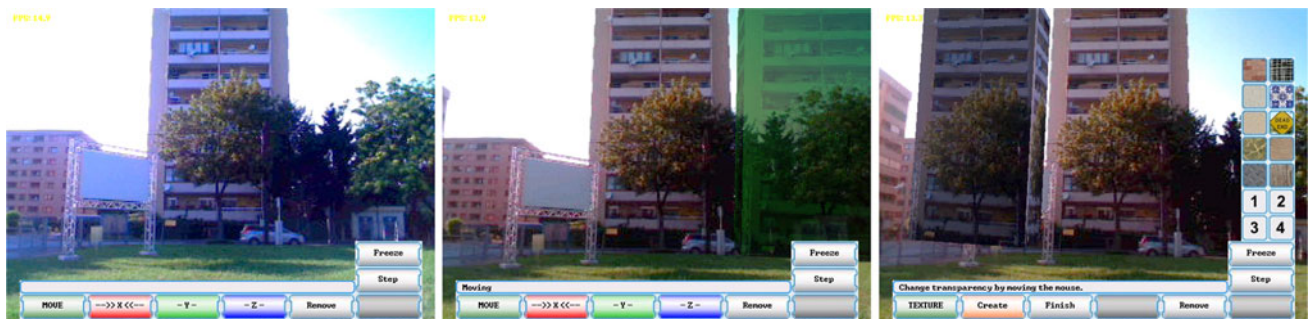
Fig. 4 Example showing the created augmented 3D content using the system configured for large working environments. Left Real scene as displayed in the camera view of the smartphone. Middle Augmented

shapes with different applied textures. Right Augmented scene showing different objects with different colors and interface for selecting colors