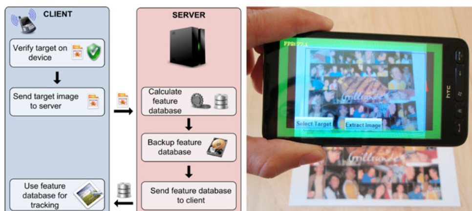
Fig. 1 Showing the online creation of a feature database, which can be used for natural feature-based tracking. Left Illustration of the needed steps to create a feature database using a remote server. Right Showing the client for creating the feature database. The green display border indicates that the outlined object in the current camera fulfills all criteria for a good target for natural feature-based tracking

This means that the user running her AR application on the phone can create a new natural feature database for tracking using her smartphone or query the server for already existing ones. Both assures that the phone is tracked in 6DoF in a previously unprepared environment with minimal effort and minimal delay as the creation of the natural feature database takes 2 s in average and the transmission takes between 5 and 10 s assuming a typical database size of less than 200 k and a 3G internet connection.